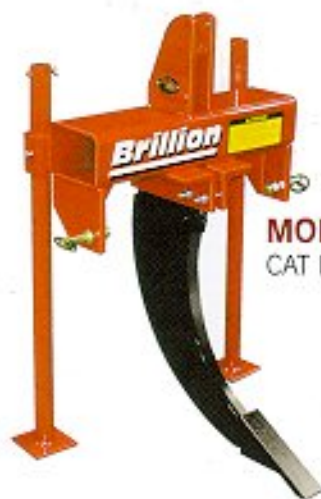
MODEL SCP-1 CAT I Hitch