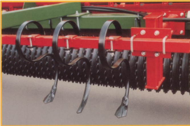
For Heavy Ground

Wheel Track Leveler Kit (For Center Seeder Only)