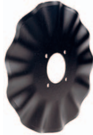
3/4" x 17" 12 Flutes