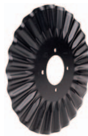
5/8" x 17" 24 Flutes