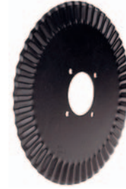
5/16" x 17" 50 Flutes