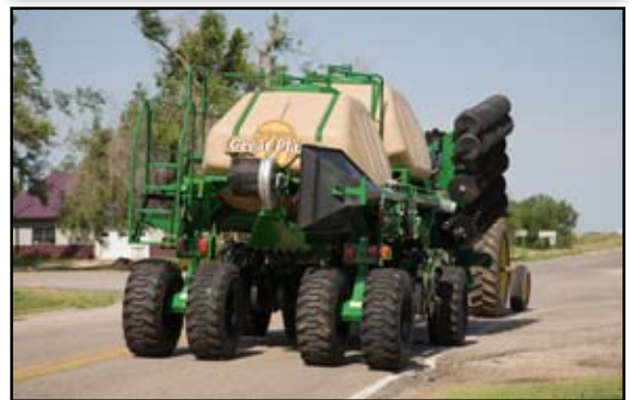
The 3007HD plants at 30' but folds to 10' at it's widest point making transport safe, easy and hassle free.