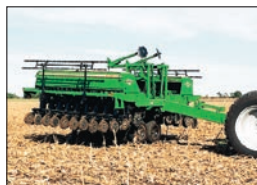
Fold For Transport