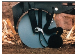
Seed Tube And Flap