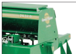
Large Seed Box