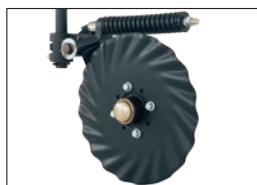
Frame Mounted Coulters