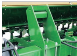
Optional Weight Brackets