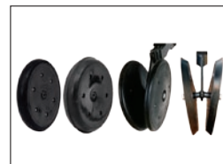
Press Wheel Choices