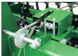
Four Speed Gearbox