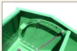
Variable Seed & Fert. Box