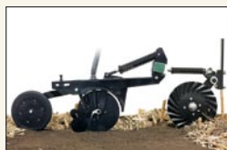
Individual Row Units