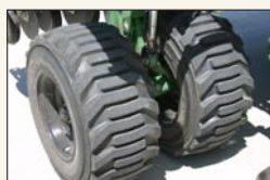
High Floatation Tires