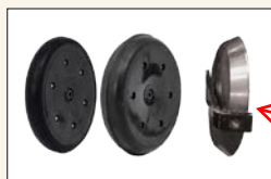
Press Wheel Choices