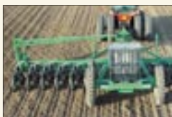
Low-Profile Flat Fold Markers