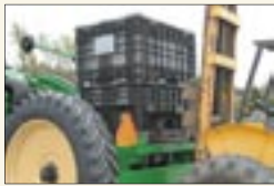
Central Bulk Fill