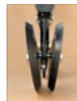
Wedge Press Wheels