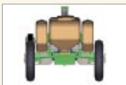
400 Gal. Starter Fert Option