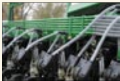
State-of-the-Art Air Delivery