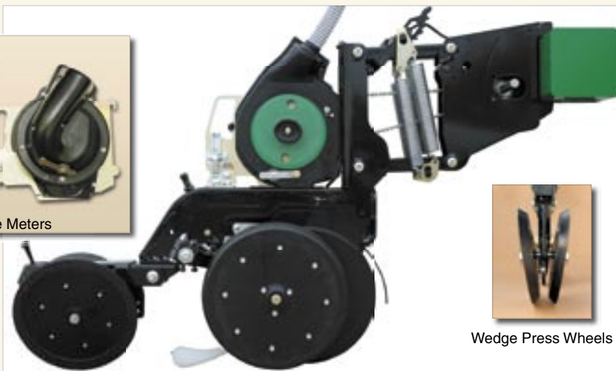
New Planter Row Unit Design