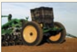
14.9" x 46" Bar Tires