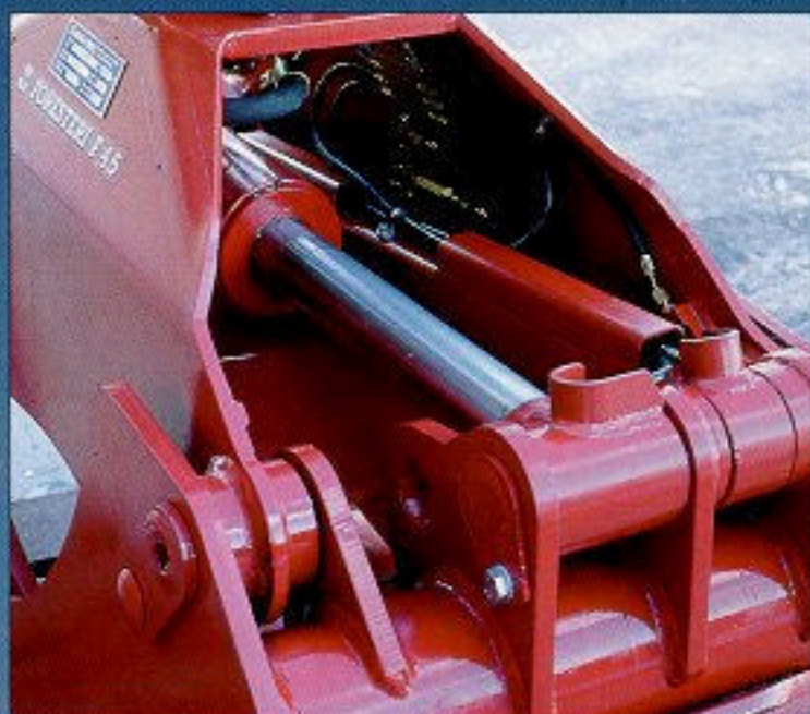
The grapples F38 and F45 can be fitted with an optional central lubrication system.