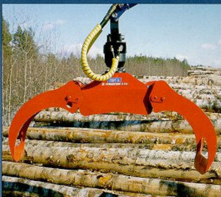
The construction of the jaws enables the grapple to dig into the pile and picking up the timber is easier.